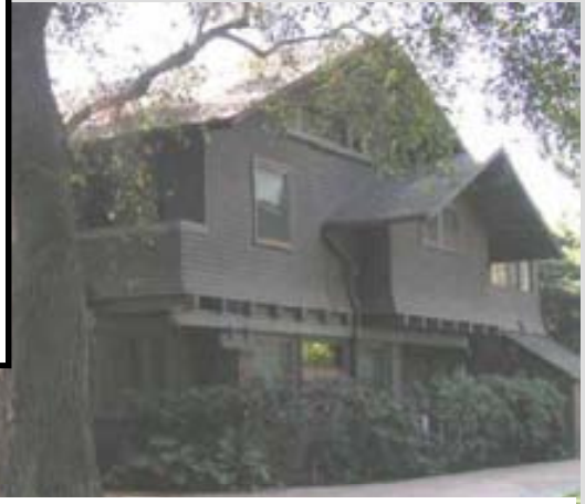
CRAFTSMAN – Larger Homes