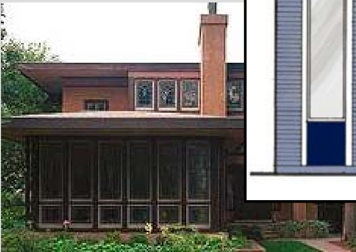
PRAIRIE – Smaller Homes