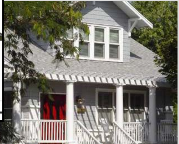
CRAFTSMAN – Smaller Homes