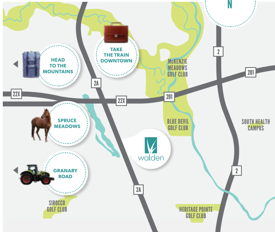
▲ ZOOMED OUT MAP

Making the most of the weekend is effortless when Walden is home. Start Friday night by taking the kids to one of Walden's many playgrounds. Get pampered at the nail salon before grabbing lunch at the local pub's rooftop patio. Book a tee time with friends next door at Blue Devil. Grab some hiking boots and cruise out to the mountains or skip some rocks on the new pond. With urban amenities and nature on your doorstep, weekends in Walden are wonderful.